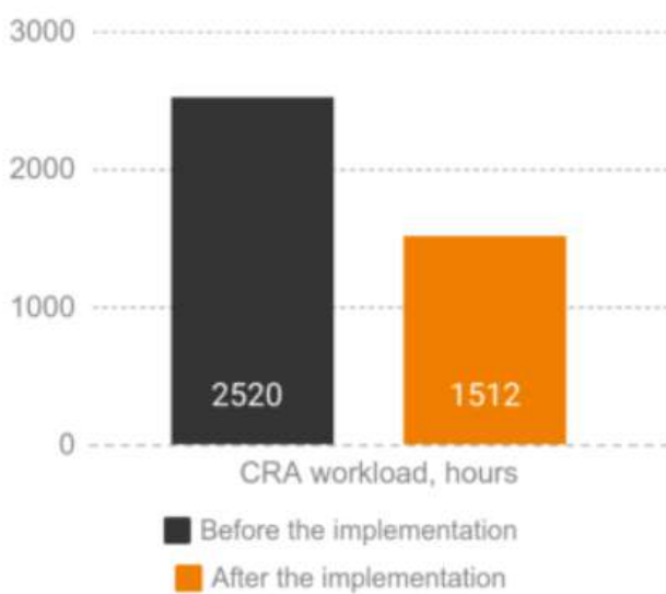
1,5 times reduction of working hours for CRAs